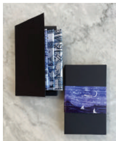
INDIGO VOYAGE BARS