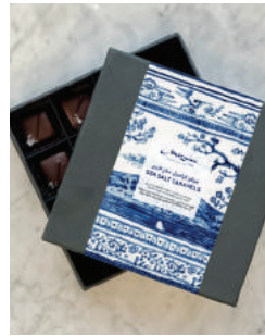
SEA SALT CARAMELS (Box of 16)