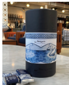
INDIGO VOYAGE (75 Pieces Mixed Bites)