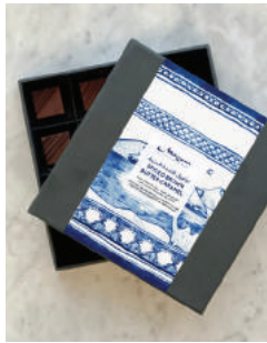
BROWN BUTTER CARAMELS (Box of 16)