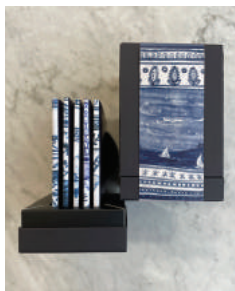
INDIGO VOYAGE BARS