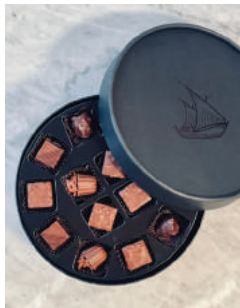
INDIGO VOYAGE TRUFFLES (Box of 28)