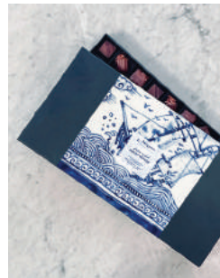
INDIGO VOYAGE TRUFFLES (Box of 50)