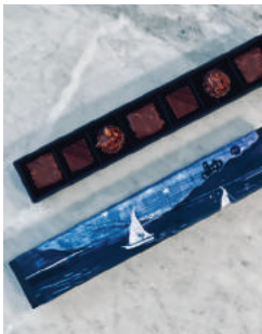
INDIGO VOYAGE TRUFFLES (Box of 7)