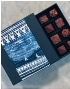
INDIGO VOYAGE TRUFFLES (Box of 16)