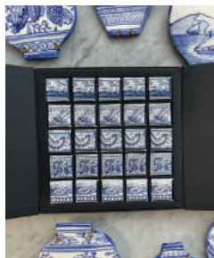
INDIGO VOYAGE (50 Pieces Mixed Bites)